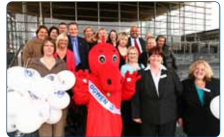
Culmination of the Welsh journey, outside the Senedd

The petition was subsequently considered by the Petitions Committee who wrote to the Minister for Health and Social Services to raise our concerns. Her response guaranteed that she would “be taking forward a number of issues...raised” and instructed officials to “continue to work with Sands to establish what